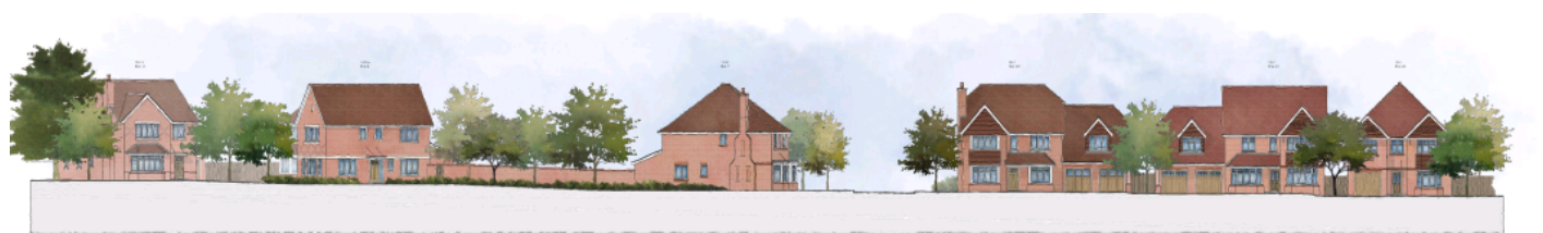
View B - B