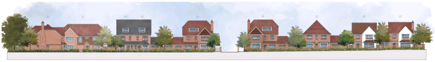
View A - A