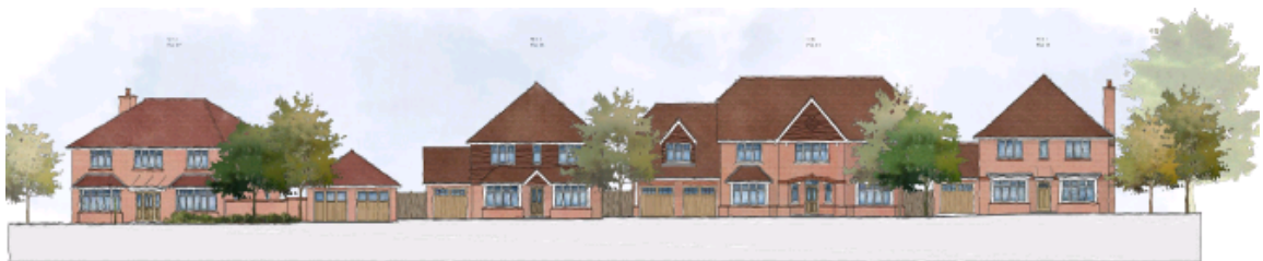
View C - C